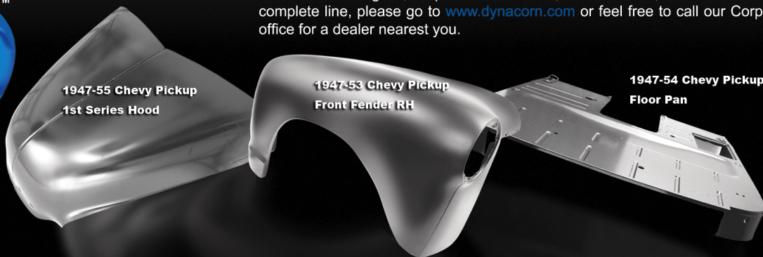
1947-55 Chevy Pickup 1st Series Hood

For a dealer locator, visit us at: www.dynacorn.com