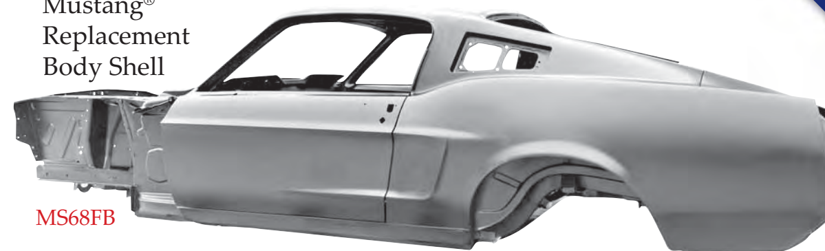
1968 Mustang® Replacement Body Shell