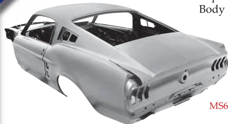
1967 Mustang® Replacement Body Shell