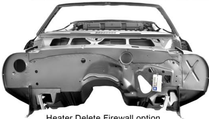
Heater Delete Firewall option FB67CVBK