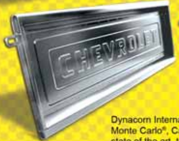
Part Number 1170 1954-87 Chevy® Pickup Tailgate for Stepside, "Chevrolet"®