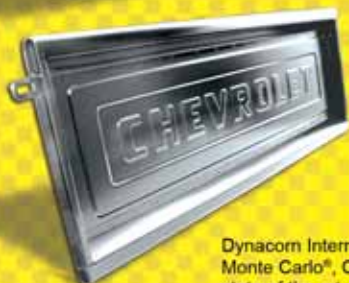
Part Number 1170 1954-87 Chevy® Pickup Tailgate for Stepside, "Chevrolet"®