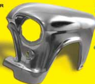
Part Number 1097U 1955-56 Chevy® Pickup Front Fender LH