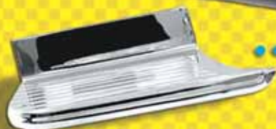
Part Number 1104JC 1955-59 Chevy® Pickup Bed Step for Longbed Chrome LH