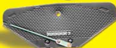
Part Number G20 1955-59 Chevy® Pickup Speedometer

Dynacorn International Inc. manufactures sheet metal, bright trim and molding for Ford®, GTO®, Nova®, Monte Carlo®, Camaro®, Chevelle® and Impala® and Chevy® Pickup, using only the finest materials in new, state of the art, tools. Our sheetmetal is thicker than original, crisper than NOS and, in most cases, fit better. For a complete line, please go to www.dynacorn.com or feel free to call our Corp. office for a dealer near you.