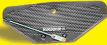
Part Number G20 1955-59 Chevy® Pickup Speedometer

Dynacorn International Inc. manufactures sheet metal, bright trim and molding for Ford®, GTO®, Nova®, Monte Carlo®, Camaro®, Chevelle® and Impala® and Chevy® Pickup, using only the finest materials in new, state of the art, tools. Our sheetmetal is thicker than original, crisper than NOS and, in most cases, fit better. For a complete line, please go to www.dynacorn.com or feel free to call our Corp. office for a dealer near you.