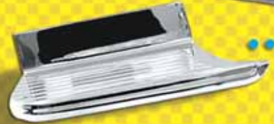
Part Number 1104JC 1955-59 Chevy® Pickup Bed Step for Longbed Chrome LH